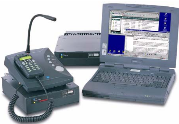
3012 HF Data Modem, NGT desk console, NGT RF Unit and computer

A front panel LED indicator shows presence of power and modem link status.